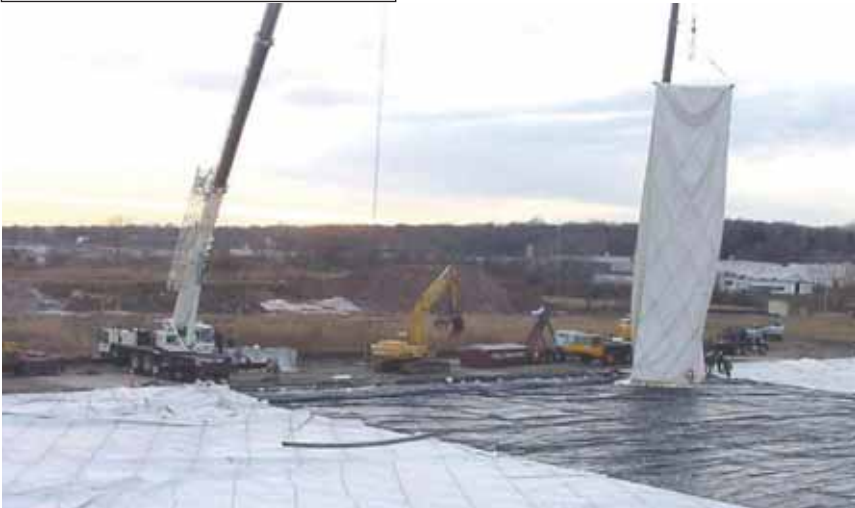
Photo 3. Removal of the bubble.