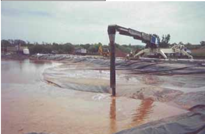
Photo 4. Placement of soil.

During placement and throughout the next year, settlement of the sludge was monitored using settlement platforms installed while the fill was being placed. In addition to the platforms, pore pressure monitoring was conducted