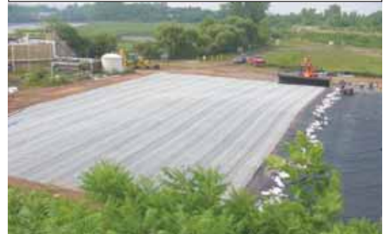
Photo 6. Completed final cover.