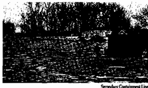
Secondary Containment Liner